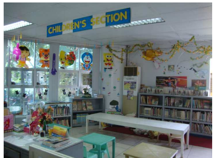
A colorful children's section