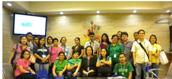
Economic and Financial Learning Center, BSP