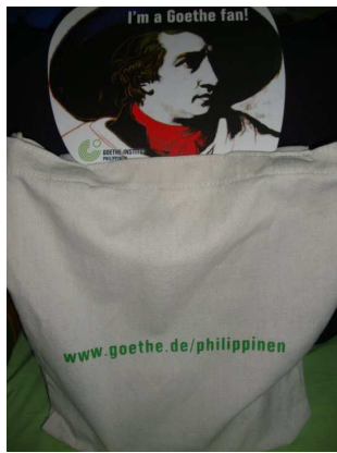
Freebies from Goethe-Institut Philippinen