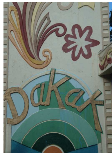
Shrine of Jose Rizal in Dapitan and Dakak