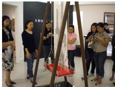
Lopez Library and Museum