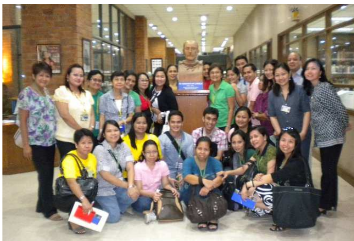
Ateneo Professional Schools

A total of 15 institutions were visited by ASLP during its “ASLP on the Go: Tour of Local and Foreign Cultural Center Libraries, Museums and Archives in Metro Manila,” that happened last July 14-15, 2011.