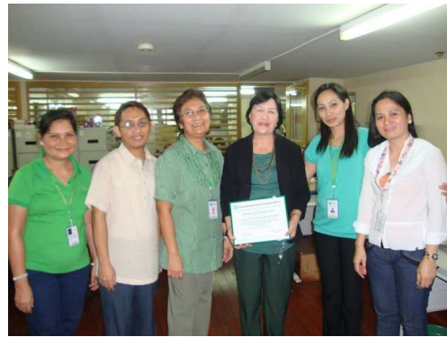
Awarding of certificate: National Archives