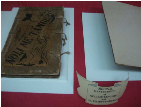
Rare books: National Library