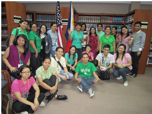
Thomas Jefferson Information Center, US Embassy