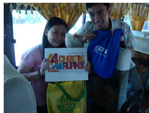
Participants get free bags from ASLP & EFLC and a Filipiniana book from Instituto Cervantes