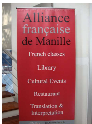
Alliance francaise de Manille