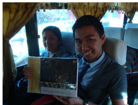
Participants show their free ILO materials

All the participants learned a lot from all the institutions we have explored in this two-day visit. An additional tour was done at the BSP money museum. There were many freebies given-away from ASLP, Instituto Cervantes, EFLC, TJIC, DLSU, ILO and GIP. EFLC treated the participants with a lunch, DLSU with doughnuts, GIP with coffee, Alliance with drinks and APS with snacks. The tour ended with a sumptuous dinner at Myrons located at Powerplant Mall in Rockwell.